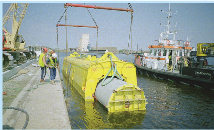
This yellow device holds four pipe sections, welded together, and also has a tank which can be filled with either air or water to provide controlled buoyancy and reduce the submerged weight of the pipe.

Occasionally, it may be necessary to conduct post-construction pressure testing on the completed