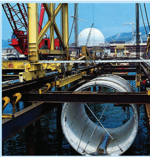
18' Prestressed Concrete Pipe, installed by gantry crane and installation barge, to provide cooling seawater to power plant.

Subaqueous installation is usually associated with open waters, such as oceans, lakes, or rivers. Access can be achieved with conventional land-based equipment utilizing temporary fill, trestles, and/or barges. For full-floating operations, a convenient staging area is required.