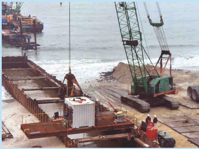
Crane used for clamshell excavation and subaqueous pipe laying.