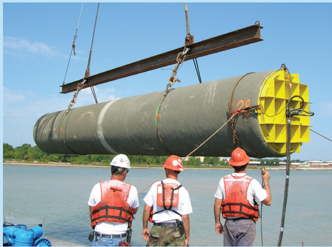
Clear view of attached Hydro-Pull® end cap with high-volume pump to facilitate subaqueous pipe engagement and joint testing. Concrete Pressure Pipe is ideal to resist the external compressive forces resulting from use of the Hydro-Pull®.

feet, and are easily suited for the pipe laying operation.