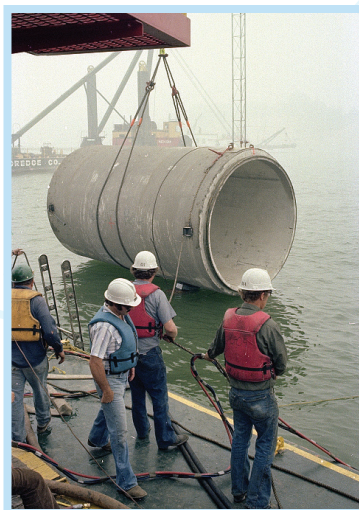
Subaqueous joint installation lugs are clearly visible on this pipe.