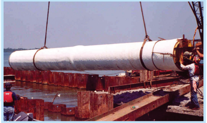
Two sections of 42" Prestressed Concrete Pipe, welded together for subaqueous installation.

Under the direction of the diver, the pipe to be installed is placed close to the previously-installed joint and is axially aligned. The pumping unit in the special bulkhead is started and a relatively small amount of water is rapidly withdrawn from the pipe. This withdrawal of water creates a pressure imbalance across the bulkhead which results in an axial compressive force that moves the pipe toward the joint. As the joint closes, the pressure differential and created axial force increases until the joint is