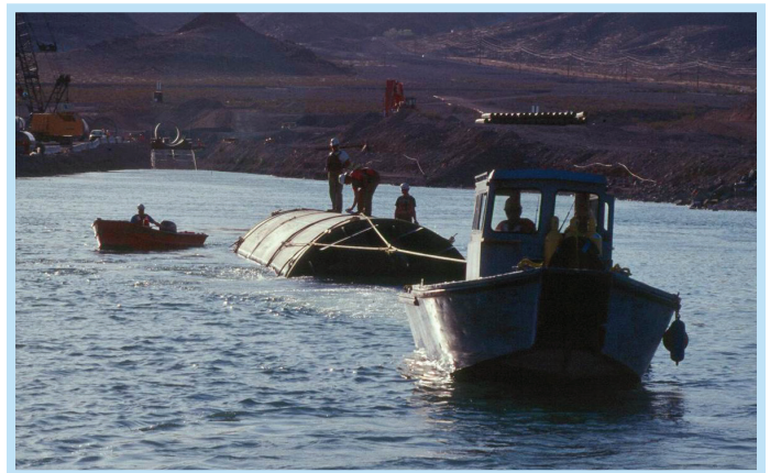
Three sections of 144” RCCP welded together are temporarily capped and floated to installation barge in Lake Mead.

The majority of subaqueous installations are done in waters with little to no visibility for the divers. This requires that all movements of the pipe must be directly conveyed by the diver to the equipment operator handling the pipe. Backhoes can be used for laying pipe but their hydraulics tend to bleed