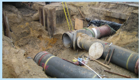
Chilled water lines being installed for the University of Wisconsin, in Madison, WI